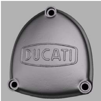
Motor cover of Ducati