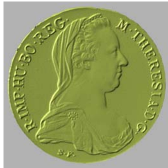
Coin Ø 45mm